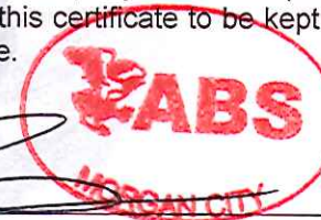
John Preston, Surveyor

It is the responsibility of the Service Provider to employ, train and qualify persons in the service provided. If the service requires approval from manufacturers, the service provider is responsible to maintain contact with the manufacturer and maintain any service manuals up to date. The employees who will conduct the servicing are to have photo identification and, if allowed, be listed on the company's web site (noted above). The products and models allowed to be serviced are to be listed on the company's web site. The ABS office issuing this certificate to be kept updated with changes to the management of the company, its employees, products and models on the list and any changes made.